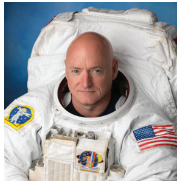
Former Astronaut Captain Scott Kelly Saturday Night Keynote Speaker