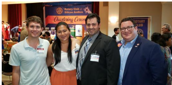
Rotaractors from Greater Fremont and Silicon Valley celebrating at the Chartering Ceremony for the Rotary Club of Silicon Andhra