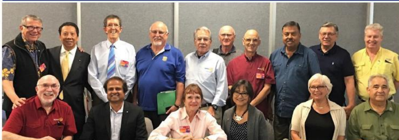
LEADERSHIP ACADEMY GRADUATES -- INCLUDING SEVEN DISTRICT GOVERNORS!