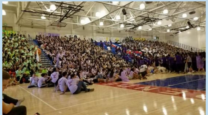
FLC at Independence High School