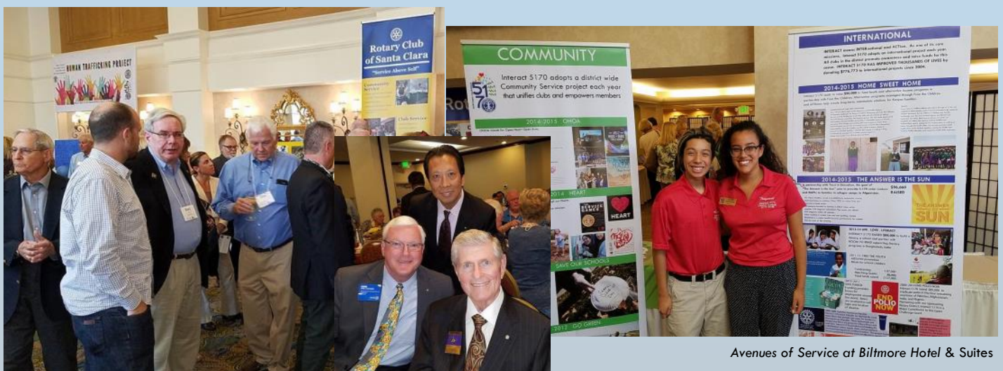
Avenues of Service at Biltmore Hotel & Suites

The only thing that could top the AOS was the Interact Fall Leadership Conference (FLC), held a few days later on October 8 th . Once again almost 4000 Interactors came together to kick off their year and announce their key Community and International Service projects. It is an event not to be missed.