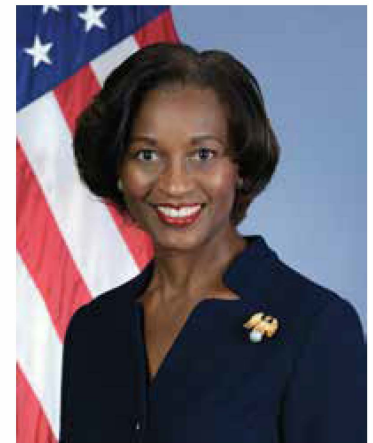
Nuria Fernandez Federal Transit Administrator US Department of Transportation

Where: Santa Clara County Board of Supervisors Chambers 70 West Hedding Street San Jose, CA