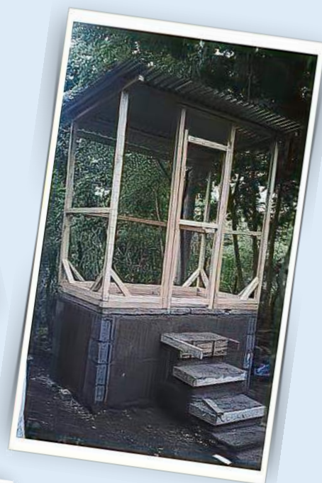
Above – Latrine Under Construction