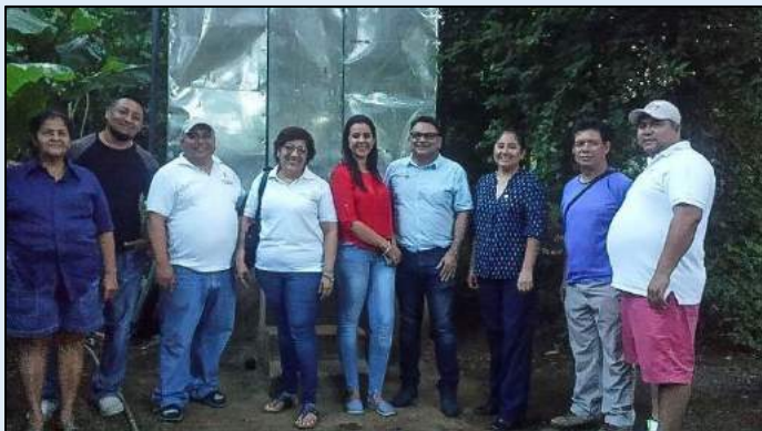
District 4240 DG visits our composting latrines

In 2010, Engineers Without Borders San Francisco Professionals (EWB-SFP) visited Los Alvarez, Nicaragua, and built ten units. In 2014, they built another 14 in El Llanito, Nicaragua. The benefitted families had successful results with these composting latrines as a sustainable solution to their health and sanitation problems, and also as a source of valuable organic fertilizer.