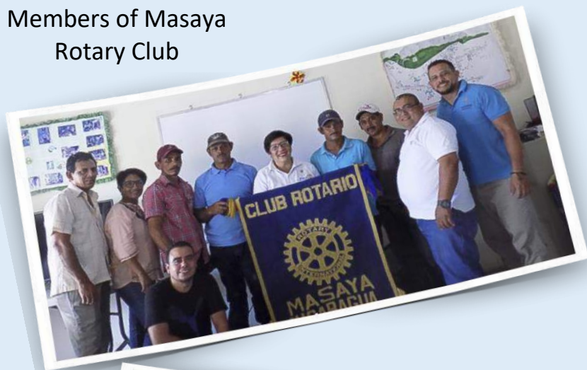
Members of Masaya Rotary Club

sites for tree irrigation. In terms of impact, erosion control in the water sheds were the early targets along the arroyos. Sixty-four trees and shrubs were planted and 7 yards of compost were spread for this purpose. The remaining projects planted 68 fifteen-gallon trees at parks and a greenhouse was erected at a school.