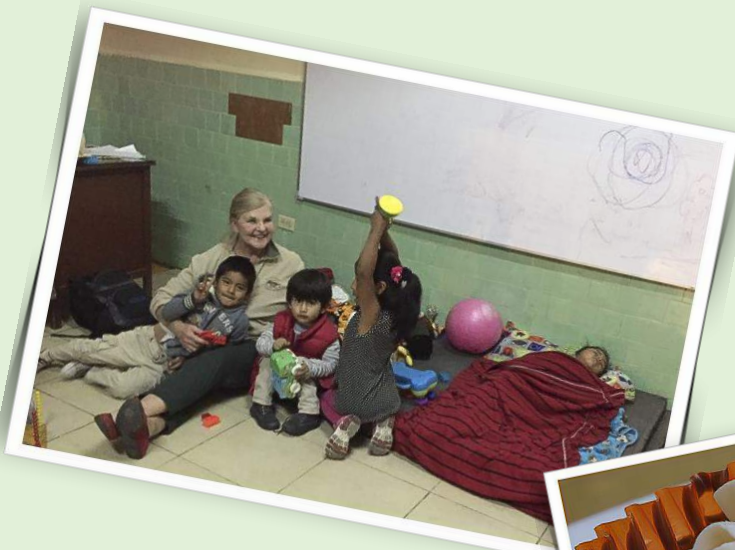
Some Children We Met

As a result, Casa Maria Amor / Mujeres con Exito has become a place to restart life for approximately 100 abused women and their kids in a given year.