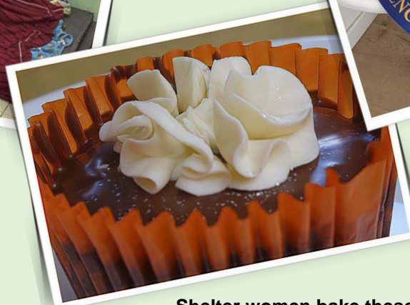
Shelter women bake these cupcakes for fundraisers to sell for $1