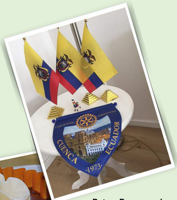
Rotary Banner and Flags of Ecuador