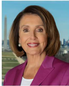
Nancy Pelosi Speaker US House of Representatives