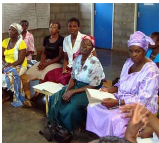
Training of a new Self Help Group in Kuwadzana, a high density suburb of the capital city of Harare, Zimbabwe

better prepared they are compared to their competitors.