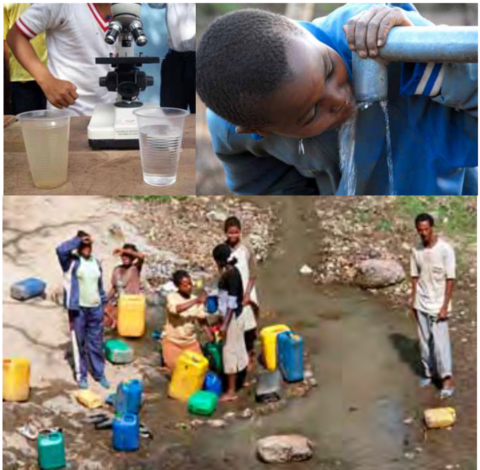
Upper left:-- Clean: Which water would you drink? Make it a choice. Upper right: -- Drinking: Your participation in RaceAcross brings clean water to those in need. Bottom- Water Collection: 865 million people lack access to clean water.

In addition to automatic tracking of money and miles, the website has the capability to accept immediate donations, provide form letters to invite others to participate in an organization's fundraiser, and accept secure credit card donations for the fundraiser. Customized clothing such as tee shirts and tank tops are also available with the RACE logo. Contact director@RaceAcross.org for more details.