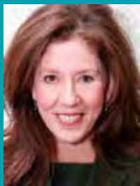
Debra Fine Well known Author and Speaker "The Fine Art of Building Rotary Relationships"