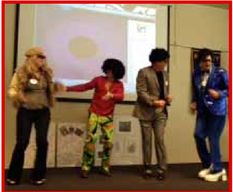
Evergreen Rotarians love to disco! Join the Line Dancing with the Evergreen Rotary Club members.