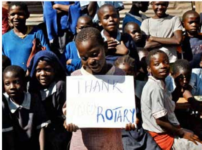
Children in Africa thanking Castle Rock High Noon Rotary for bringing them books.

and potentially in other districts, work together to produce a multi faceted project, a significant part of which would incorporate the establishment of Farm Business Advisors through iDE. These Farm Business Advisors would teach modern farming, irrigation, water