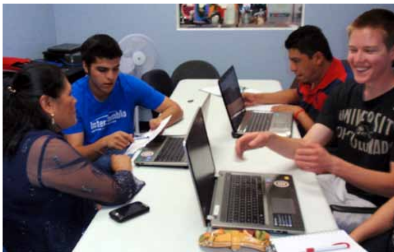
CU Students also participated in giving Intercambio Computer Literacy classes to immigrants

student population to improve computer literacy. Computer skills have a significant impact on economic