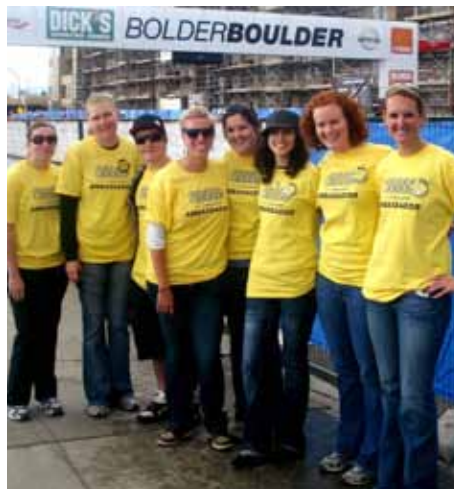
The Boulder New Generations Rotary Club volunteers as Race Ambassadors at the Boulder Boulder 10k race every Memorial Day.

Locally they support the YMCA’s “Kid’s Triathlon”, the Homeless shelter and Intercambio. Internationally they have worked with “Engineers without Borders” in Nepal and are developing a project in Peru, working with leadership development of young Peruvian women in collaboration with “Peruvian Heart’s” and organization well known to Evergreen Rotary. They are raising funds through work with the Boulder Boulder and the Boulder Buffalo Bicycle classic and support to our Signature event They have increased our community’s awareness of Rotary