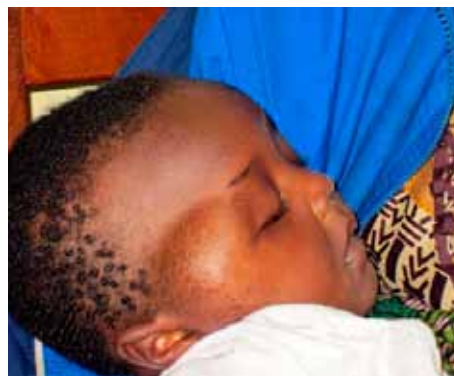
Tumors of the face, sinuses and neck are prevalent in Northwest Cameroon.