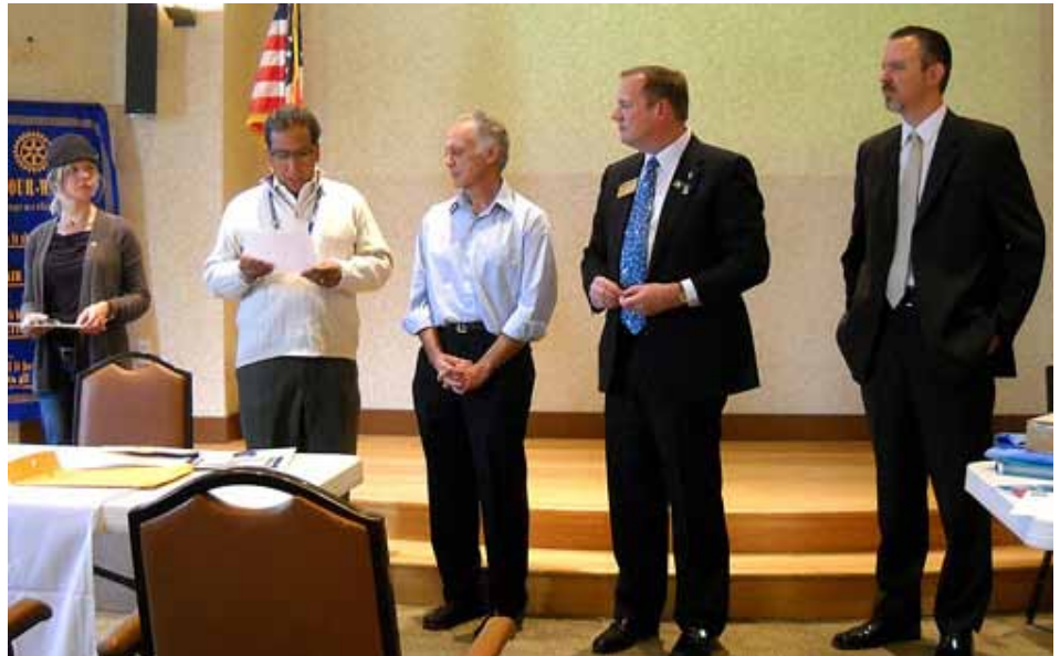
Coal Creek Rotary inducts new members.

Speaking of the Rule of 85 - do you know how the Rule of 85 is applied in