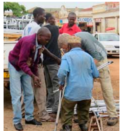
Long awaited crutches received in Mbale, Uganda