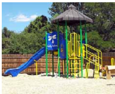
Playground equipment for 2-5 year olds now exists in a clean and therapeutic environment.

The new equipment provides vital gross motor skill development while giving the children the recreational,