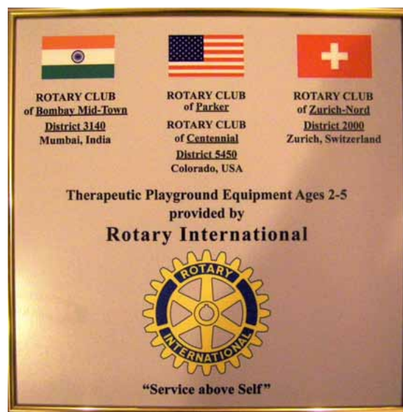
Plaque designating Rotary Districts and clubs involved in Firefly Center for Autism playground project.

is no standard protocol for treatment of autism, each individual must be treated according to their unique symptoms and level of capability. Discussions with the Center revealed that specially designed playground equipment was one item that could add immeasurably to their therapies.