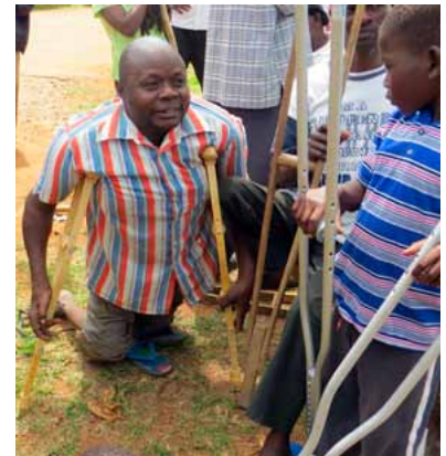
Extra small crutches put to good use