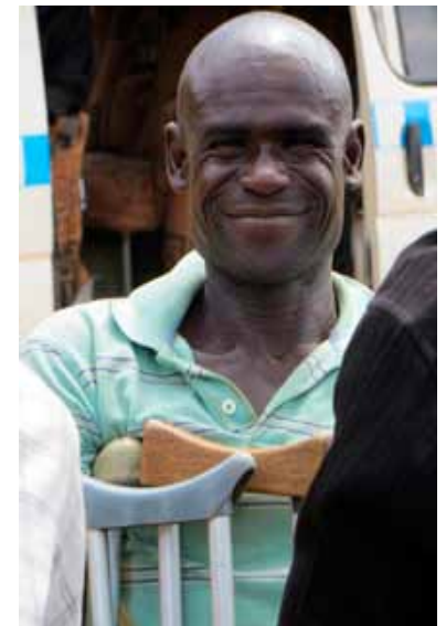
No words necessary