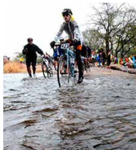
It was a mighty wet day for the almost 9000 riders participating in the El Tour de Tucson.