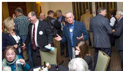
I ask you, is this the best time ever?