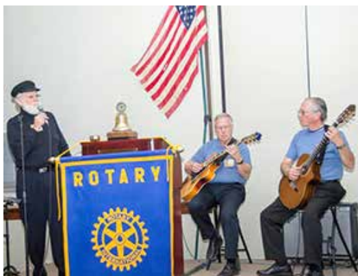
Area 2 steps it up with music to add to the laughter and camaraderie at their assembly.

Aurora, Aurora Fitzsimmons, Aurora Gateway, Denver Stapleton, Smokey Hill