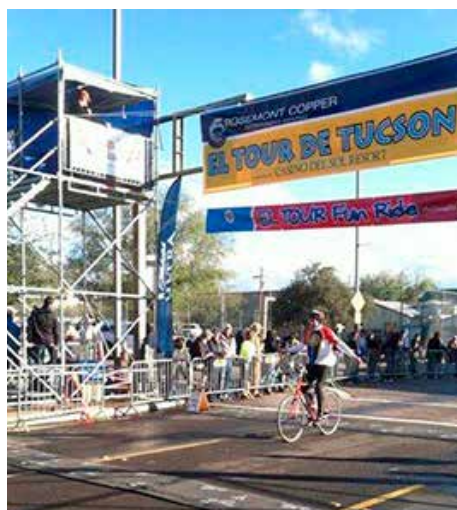
Littleton's Gary Leitch crosses the finish line in the El Tour de Tucson bike classic.