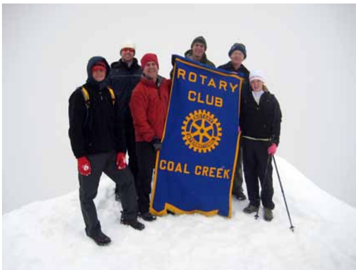
Coal Creek Rotary Club in action: 2009 Mt. LaPlata