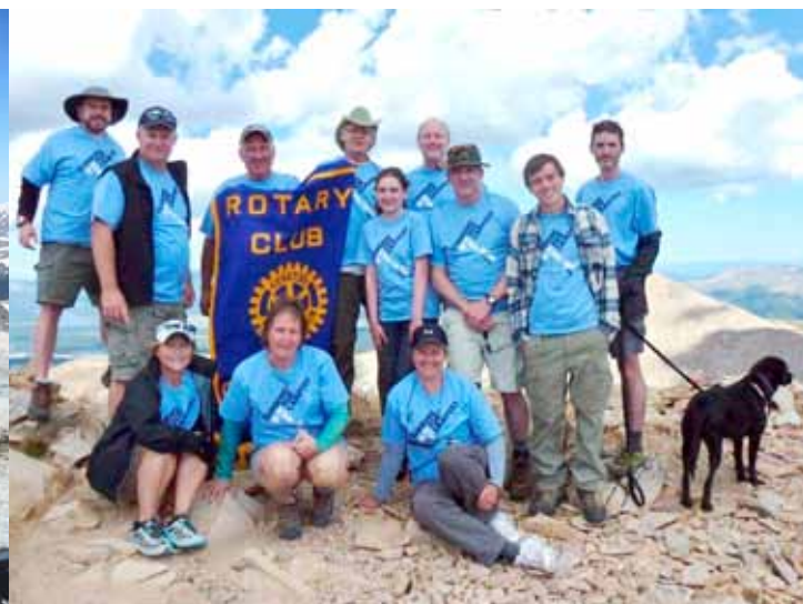
Coal Creek Rotary Club in action: 2012-Mt. Sherman