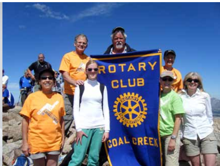
Coal Creek Rotary Club in action: 2010 Mt. Bierstadt