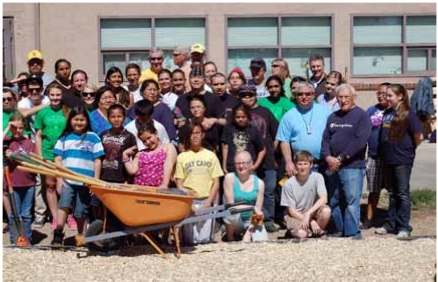
The community gathers to help rejuvenate a worn-out playground.