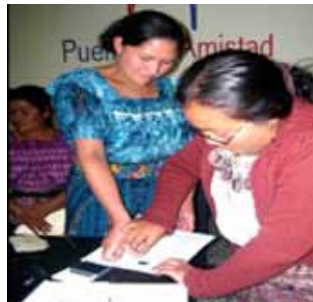
Las Flores Trust Bank, signing contract