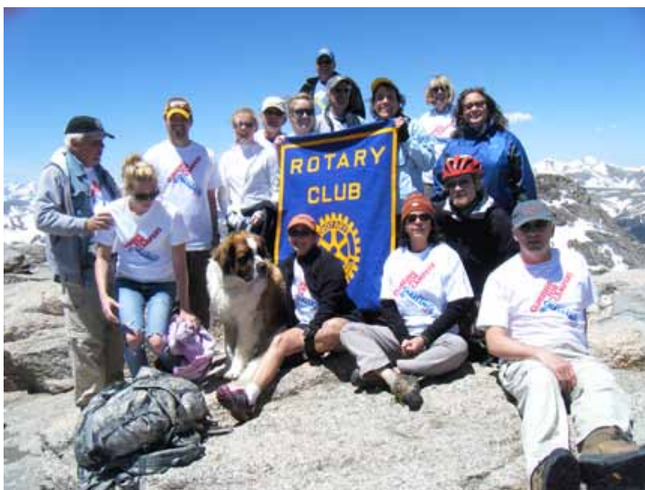
Coal Creek Rotary Club in action: 2011 Mt. Evans