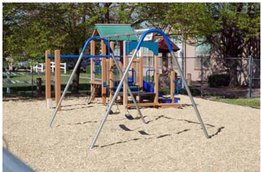
A nice new playground built by the community to benefit one and all!