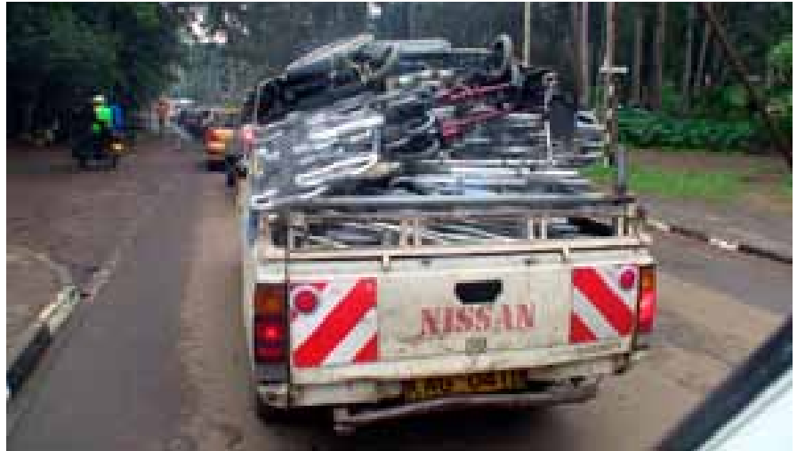
Truck filled with crutches, canes and wheelchairs in Nairobi.

We have been here before and God willing, we will return again to build upon the foundation of good will and hope. We departed with the prayers of those there that remain in that place called Kibera, still ringing in our ears.