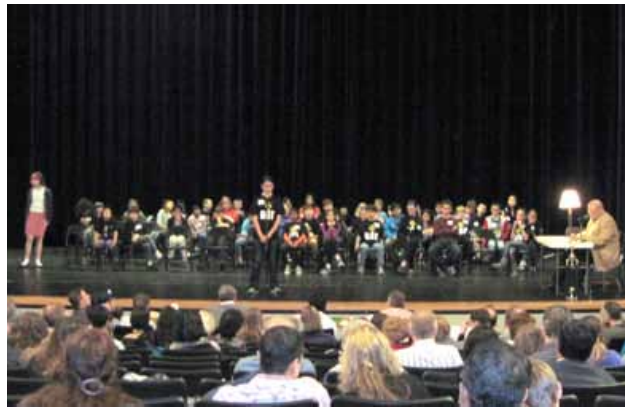
The Spelling Bee participants on stage in the auditorium of Monarch High School in Louisville.