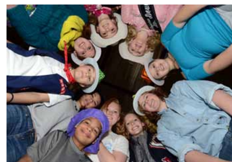
YRYLA and RYLA students lead the kids in a team event.