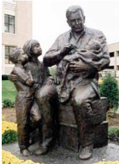
The Glenna Goodacre sculpture depicting Dr. Albert Sabin administering polio vaccine drops to an infant will be rededicated at the Anschutz CU Medical Campus on Thursday, June 6.

To date this year, there have been 24 cases of poliovirus diagnosed in the world, Nigeria (16), Pakistan (6), and Afghanistan (2). There were 52 by this time last year. On a recent NID in India, 70 million children under 5 years