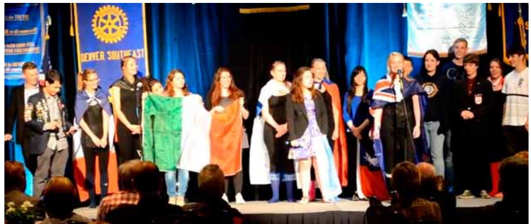
Rotary Youth Exchange students say THANK YOU in their native tongue at the 2013 District Conference in Vail.

gave a program on compassion that had everybody in tears (and, yes we all sang Puff the Magic Dragon), Karl Mecklenberg