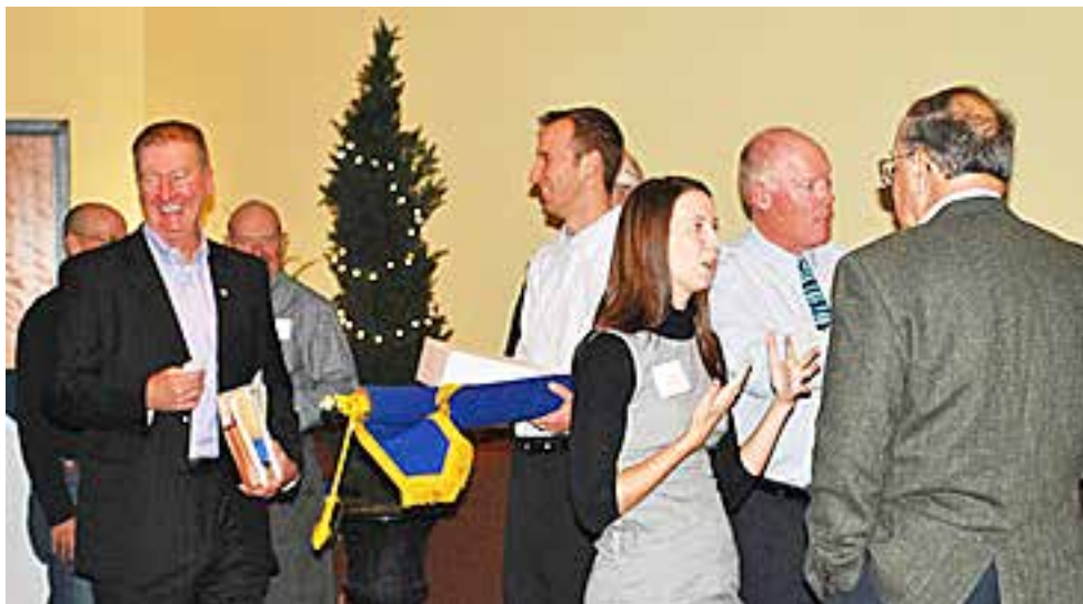
Getting to know you and your Club is a hallmark of the Area Assemblies