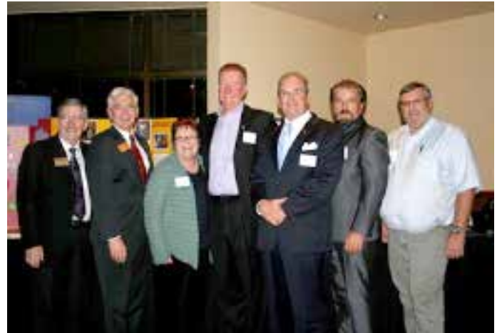
The effective assembly leadership which inspired one Rotarian to say "This is the best Rotary meeting I've attended in years."

Area 10 Rotary Clubs of Arvada, Arvada Sunrise, Broomfield, Broomfield Crossing, Wheatridge