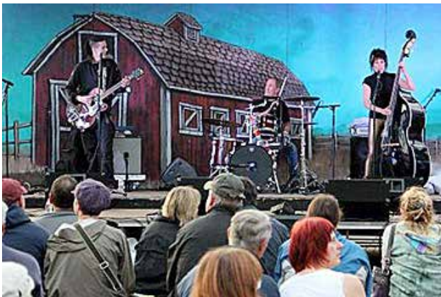
Top notch free entertainment, headlined by the Nacho Men, throughout the event drew large crowds for the first year event.