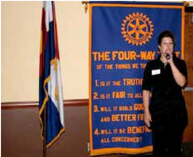
Can you hear the Star Spangled Banner being beautifully sung?

Area 10 Assembly Thursday, October 24, 2013