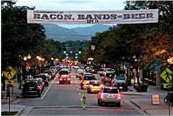
BACON, BANDS AND BEER banner flies over Littleton's Main Street for several weeks before the September 14th event.