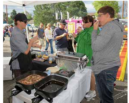
MAKIN BACON! One of the many food booths that specialized in bacon featured recipes during Littleton Rotary's Alferd Packer Bacon Party.

Proceeds from this happy event benefit the Littleton Rotary Foundation. The Foundation benefits dozens upon dozens of community projects and services throughout the greater Littleton Community. Additionally, the Littleton Rotary Foundation provides seed money for international service projects spearheaded by the Littleton Rotary Club's International Service Committee, often in conjunction with other area Rotary Clubs. Some of these international projects: providing textbooks and instructional aids for teachers in remote areas of Guatemala and the Democratic Republic of Congo; pure water storage and distribution systems for rural villages in Honduras; and most recently, Bio-Sand Water Filters for over 500 villagers in rural Nicaragua.