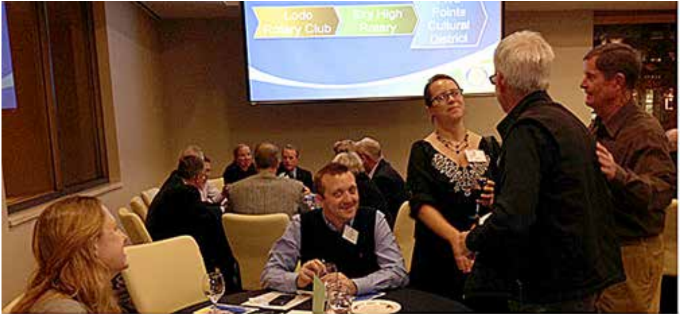
Denver Metro Rotaract, Denver Mile High, Denver Sky High in the midst of collaboration talks.

Area I Assembly Tuesday, October 29, 2013