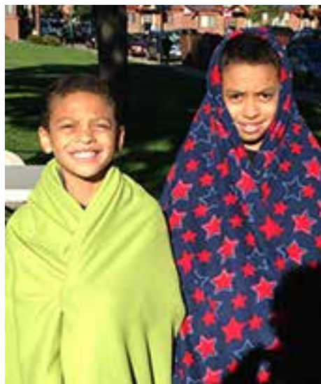
Two brothers who arrived with nothing but a blanket around them and were totally excited to receive new winter coats.

The program is a joint partnership of the Denver Housing Authority and Operation Warm, Inc., a non-profit charitable organization dedicated to distributing high quality, new winter coats to children living in need. In just over ten years, Operation Warm has distributed more than 1.2 million new winter coats to children in need throughout the US.