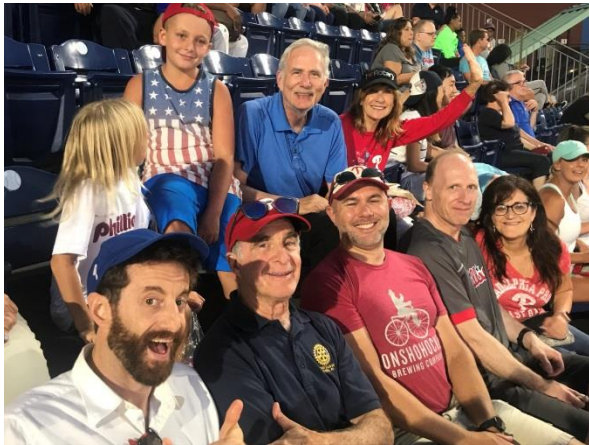
District 7430 Rotarians enjoying the Phillies game

Over 1200 Phillies tickets were sold to many Rotary Districts surrounding Citizens Bank Park. $10 from each ticket was donated to Polio Plus. To top it off, the Phillies won in the bottom of the ninth inning on a grand slam home run by Bryce Harper!