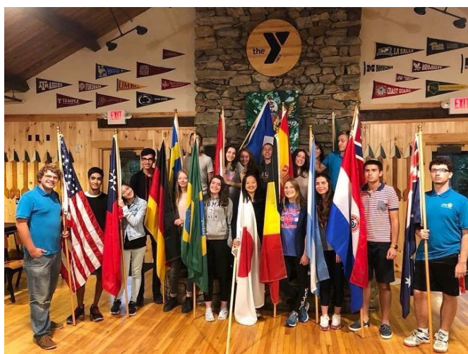
2018-19 Inbound Student Orientation