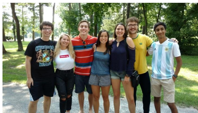
The annual "rebound" picnic of last year's Outbound students.