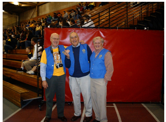
Easton Club members are visible in their Rotary vests.

Rotary Club of Easton hosted its Thirteenth Annual Holiday Classic Basketball Tournament at Lafayette College on December 28 and 29, 2009. Boys and Girls teams participated from Wilson Area High School, Notre Dame High School, Phillipsburg High School, and Easton Area High School. The Tournament has netted over $110,000 since its inception and this year's tournament brought record-breaking attendance. Notre Dame Varsity Boys placed first and Wilson Varsity Girls placed second.