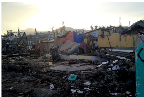
Tacloban still in devastation after Typhoon Haiyan, Leyte, Philippines, January 2014.