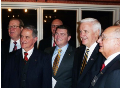
Governor Corbett (2nd from right) with several local Rotary Club Presidents

A Rotary Leadership Dinner Meeting was held on Wednesday January 29, 2014 at the Manor House in Ambler. The Keynote Speaker was PA Governor Tom Corbett.