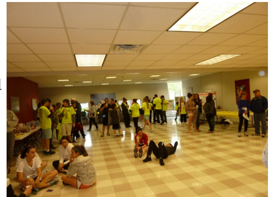
Waiting for the awards ceremony