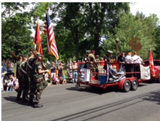
Doylestown Parade Volunteers