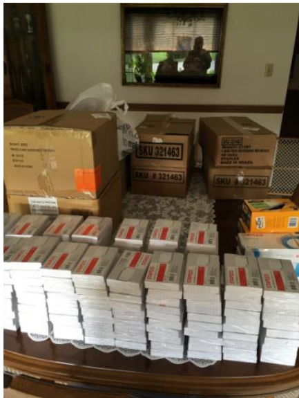
Saucon Center Valley