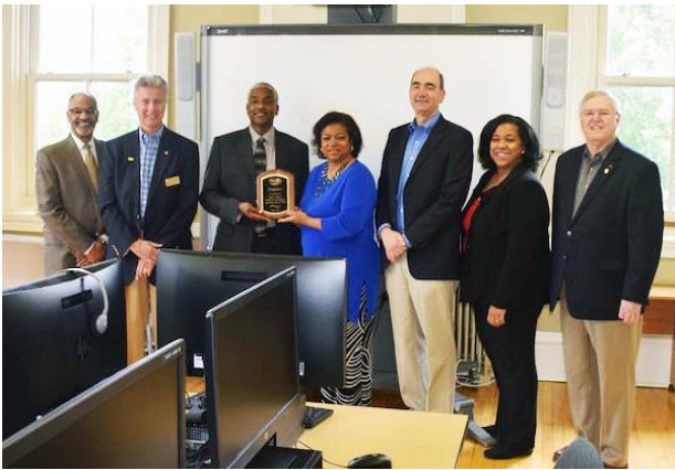
Ambler & Norristown