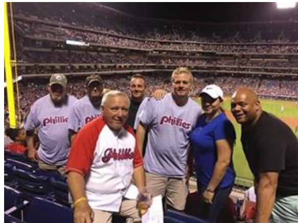
Bethlehem Morning Star