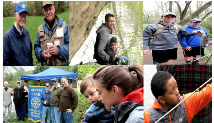
Huntingdon Valley Churchville