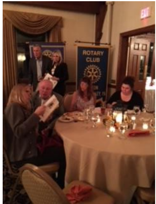
Saucon, Center Valley