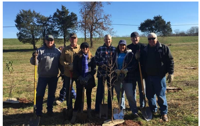
Harleysville & Souderton Telford