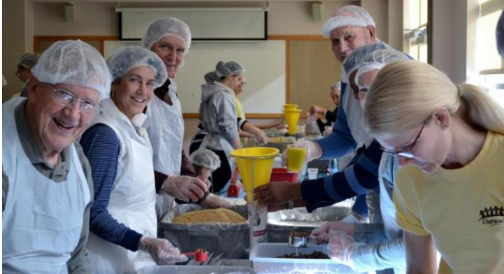
Area 2 RCs -- Bethlehem, Beth. Morning Star, Easton, Nazareth and Saucon Center Valley