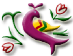
West Reading Wyomissing