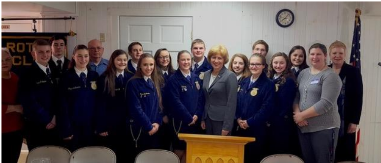
Kutztown Farmers' Night