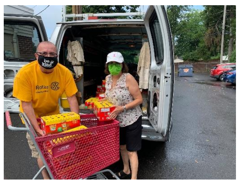
Horsham Rotary Club Horsham Rotary donated $1K in chocolate milk to HAT packs.

Ten nonprofits were awarded a total of $25,000 by Allentown Rotary to aid them in their efforts to support those most severely affected by Covid 19. Recipients included The Salvation Army, Lehigh Valley/Allentown; Community Action Committee of the LV; Community Bike Works; Lily's Hope Foundation; The Allentown Symphony Association; Cedar Crest College; Da Vinci Science Center; The Fund to Benefit Children and Youth; Turning Point of the Lehigh Valley, Inc; YWCA. See full article on page eleven.