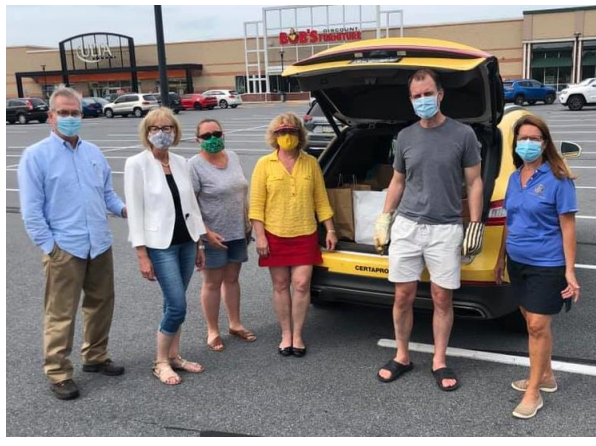
West Reading-Wyomissing Rotary Club On the fifth Thursday of each month, West Reading-Wyomissing Rotary serves dinner at Hope Rescue Mission. Together, we fight hunger!