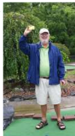
Hole In One Prize

Saucon is organizing a Bowling Event for the fall and all four clubs are planning a weekend Festival in Quakertown in the summer of 2016.