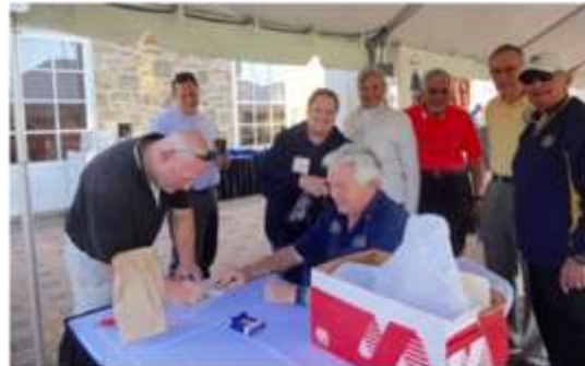
District Golf Committee Members