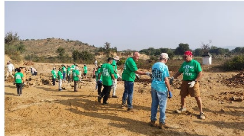
We worked mostly in a congo line with the locals.