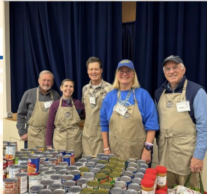
Saco Bay Rotary Club

In addition to the fundraising efforts, the club continues to host monthly off-site fellowship gatherings and regularly volunteers with local community meal programs, including Bon Appetit and the Saco Meals Program.