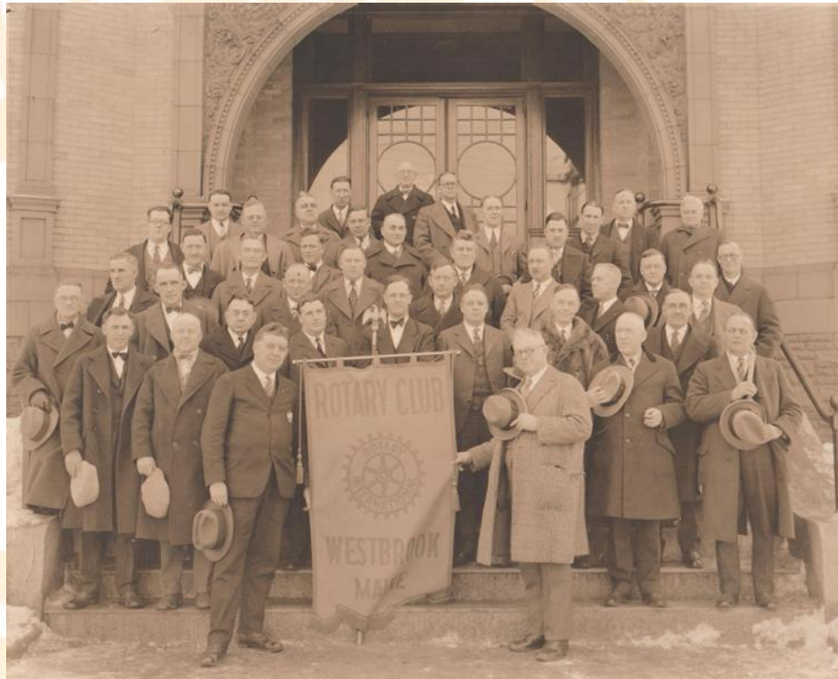
1926 Charter Members standing in front of Walker Memorial Library on Main St, Westbrook

March 8, 1926 with files from the archives