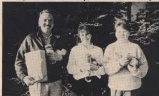
News from Oxford Hills Rotary