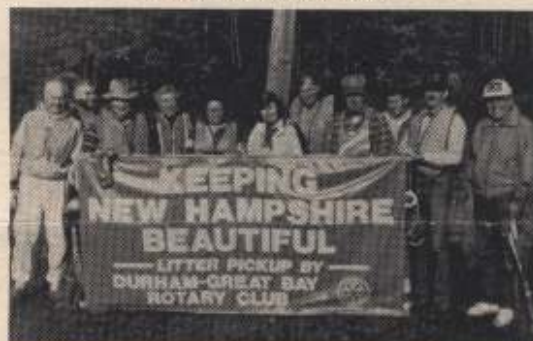
"Sharing Community Service and Fellowship, the Durham-Great Bay Rotary Club"