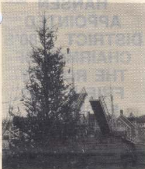
OGUNQUIT ROTARY is pictured erecting, decorating their tree in Ogunquit Rotary Park, and singing Christmas carols with the Village Elementary School.

Rotary Clubs throughout District 7780 traditionally use this time to engage in Rotary Club Service.