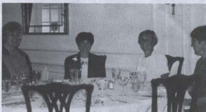
The Spouses's Luncheon...