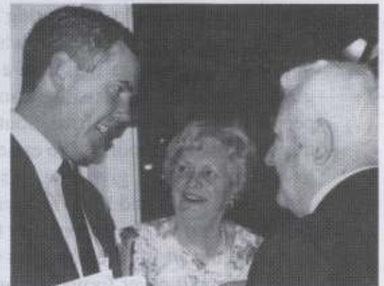
How Did You EVER Talk Me into this, Guv-na???