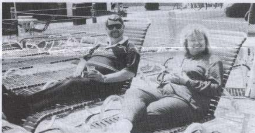
Relaxing by the pool...