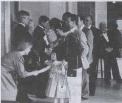
The receiving line...