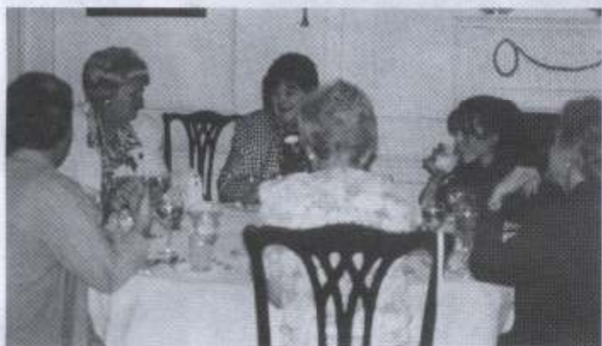
The Spouses's Luncheon...