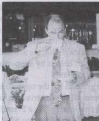
Yes, there MUST be time for coffee break!