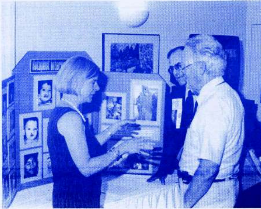
"We learned more about ROTOPLAST"