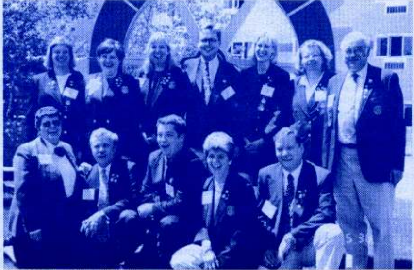
"America and Finland united in GSE"

What a treat it has been to have the GSE team from Finland here for the past few weeks. Each one of them was so interesting and so personable! Their presentations at the clubs and the District Conference, along with the outbound team's program at the conference, helped us to learn about the similarities and differences between our cultures. For instance, we learned that: The Finns tend to have elaborate table displays; Finland is at the same latitude as Alaska; Vacation time is very important to the Finns and everyone takes vacations, even prisoners!