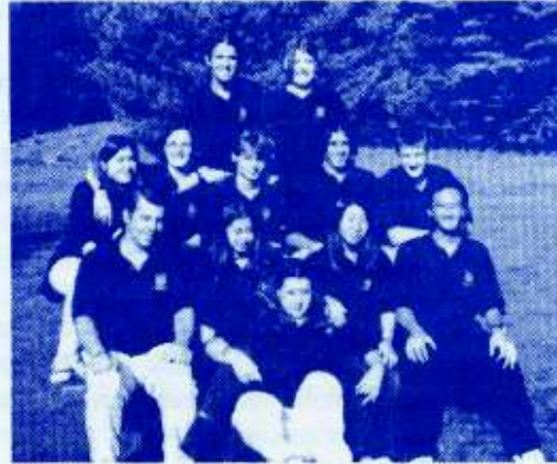
The Students are:

host families. It was really wonderful to see so many counselors and host families participate in the program. It gave everyone the opportunity to learn what is expected of them and to answer their questions. It wasn't all work during the weekend. The kids got to go on a hike, swimming, play games, listen to music and sing! The weekend was a huge success and ended with a cookout for everyone on Sunday.