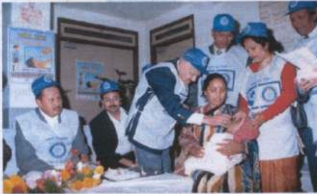
Nepalese Rotarians volunteer at National Immunization Days.