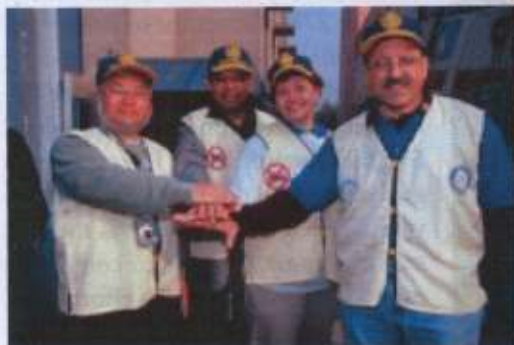
Indian Rotarians join hands with American Rotarians to fight polio.