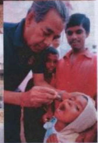
Effective immunization has eliminated polio from Bangladesh.