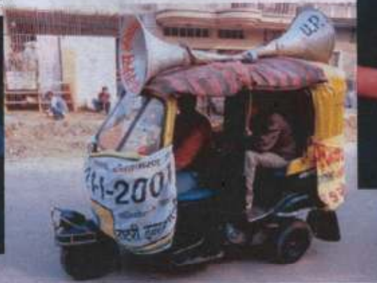
A motorized rickshaw promotes polio immunization.