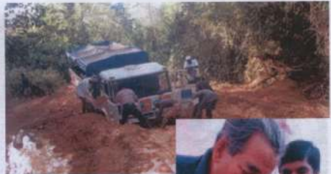
Poor roads hinder vaccine delivery in Liberia.