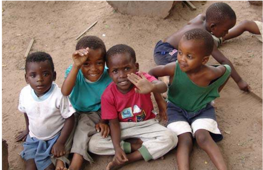
Children at Jabulani, a self help center in South Africa

February is World Understanding Month. As we approach Rotary's 99th Birthday, we can be proud of the work Rotarians have done to further world peace. After all, this is Rotary International's number one goal. The Trustees of Rotary reinforced this commitment by establishing seventy annual World Peace and Understanding Scholarships at seven universities worldwide.