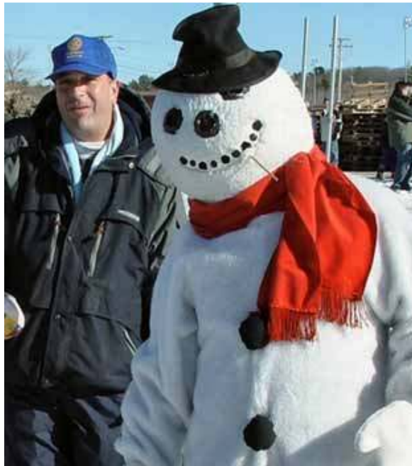
Frosty the Snowman makes an appearance at Scarborough Rotary's Turkey Bowl