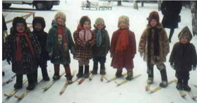
Children from the Eagle's Nest Orphanage, Tomsk, Russia.