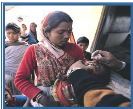
Polio vaccine for 200 children!

For as little as $100, your contribution helps provide