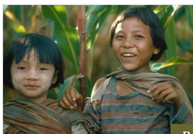
De-worming tablets for 112 children in the Phillipines!