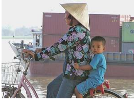
of a mother and child in Vietnam.