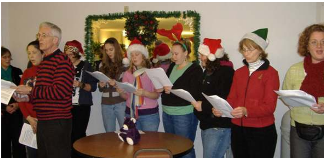
Caroling with Interact Students