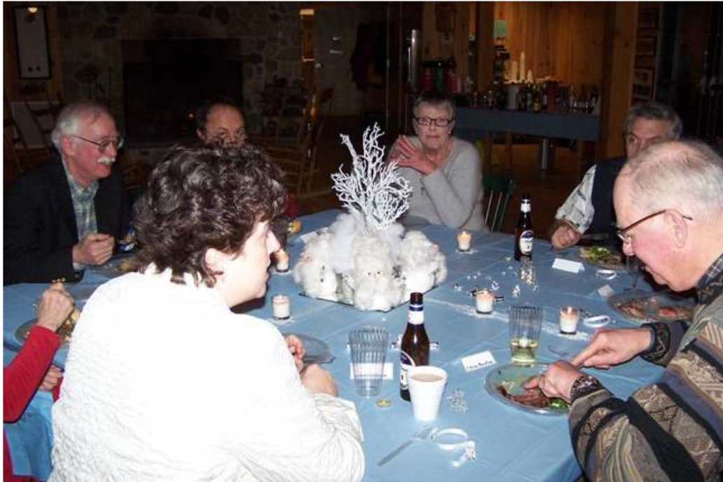
Damariscotta Rotarians and extended Family of Rotary members enjoy the meal and company.