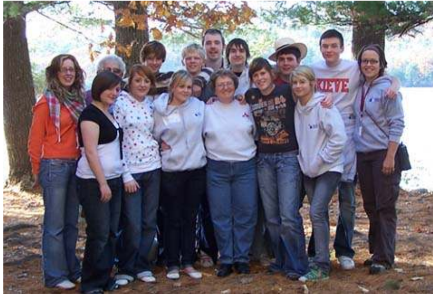
Friends Forever saying goodbye after a beautiful friendship building experience at Camp Kieve