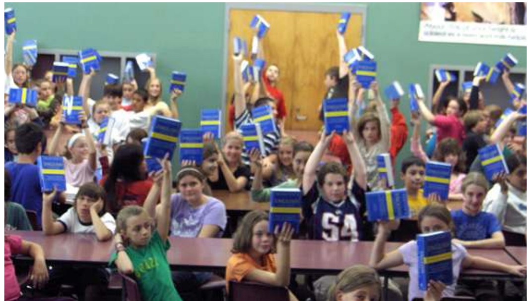
Dictionaries Aloft! Fryeburg Area Rotary's distribution of dictionaries to the Molly Ocket 6th graders. Each year, the Fryeburg Area Rotary Club buys a dictionary for every child in the sixth grade at Molly Ocket Middle School, and hands them out personally to the kids. Here is the entire 6th grade with their new dictionaries!