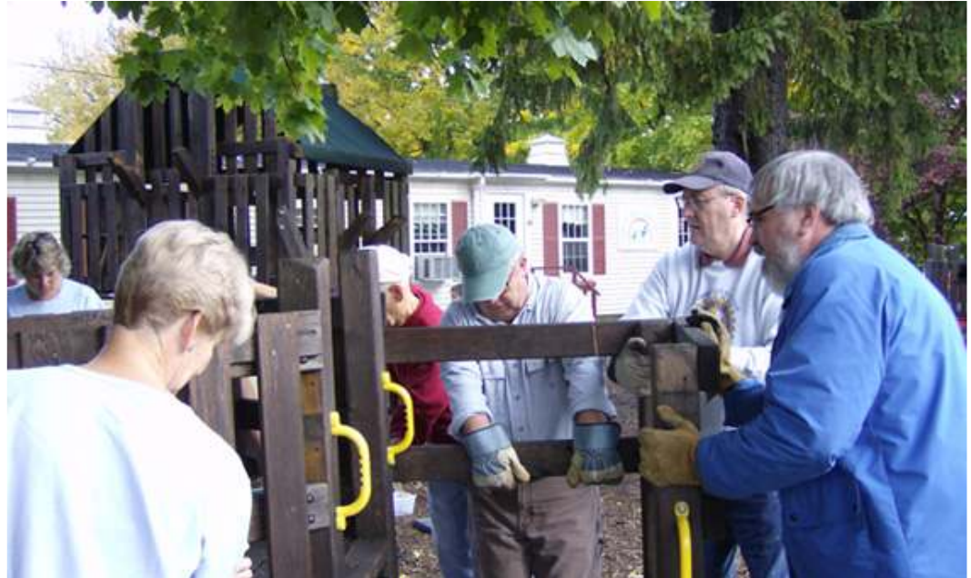
Oxford Hills Club doing a community service project moving the Child Health Center's playground equipment

As a result of our financial commitment to this mission, three non-medical volunteers from our District will be able to assist with the mission to La Oroya. If you are interested in participating as a member of the non-medical team, you must complete an application form, found on the Rotaplast website ( www.rotaplast.org ), and return it to the District Rotaplast Committee by early March, 2008. This is an amazing opportunity to provide support for the medical teams who truly change the lives of children (and adults) by providing reconstructive surgery. You will meet dedicated Rotarians from several countries, tremendous medical volunteers, and the grateful families whom this mission will serve – and it may just change your life, as well!