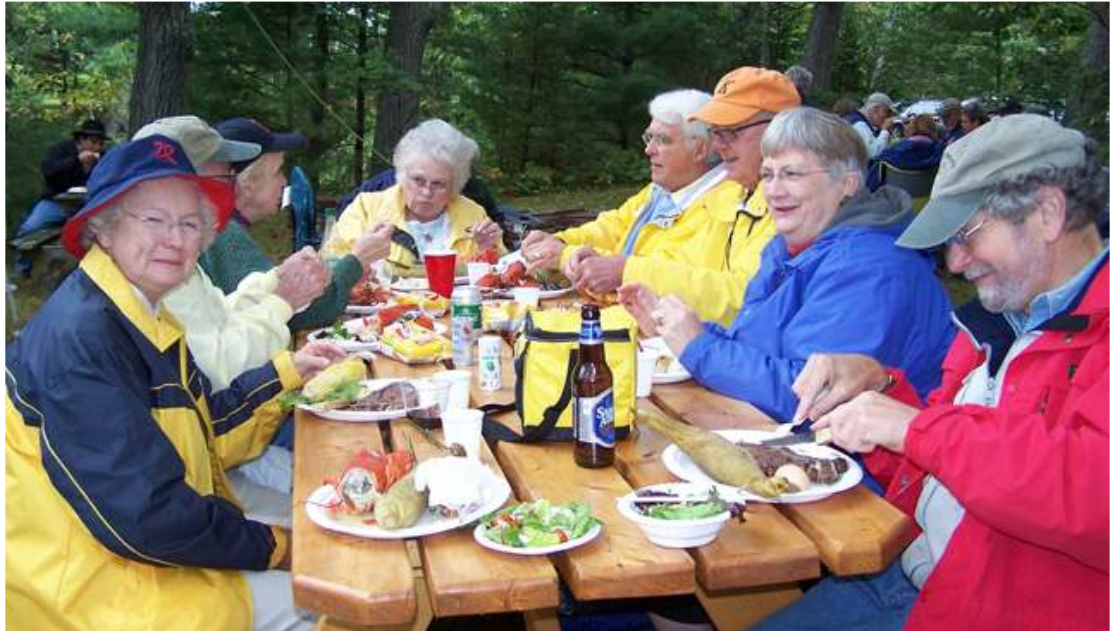
Damariscotta-Newcastle Celebrates with a "Family of Rotary" Lobster Bake on the Damariscotta River