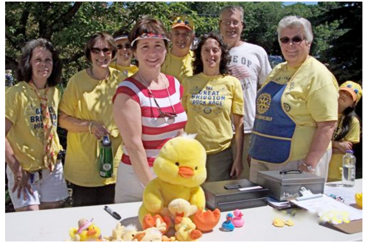
Rotary members sell "duck" paraphernalia; always popular the day of the race.

Our next fundraiser will be a Wine Tasting/Sunset Cruise on The Songo Queen in Naples on August 23rd. The cruise begins at 7 p.m. followed by a wine tasting at 8 p.m. $30 includes the cruise, six tastings, plenty of hors d'oeuvres, live music by The Blue Willow Band and the opportunity to purchase cases of your favorite wine. This is sure to be an annual favorite.