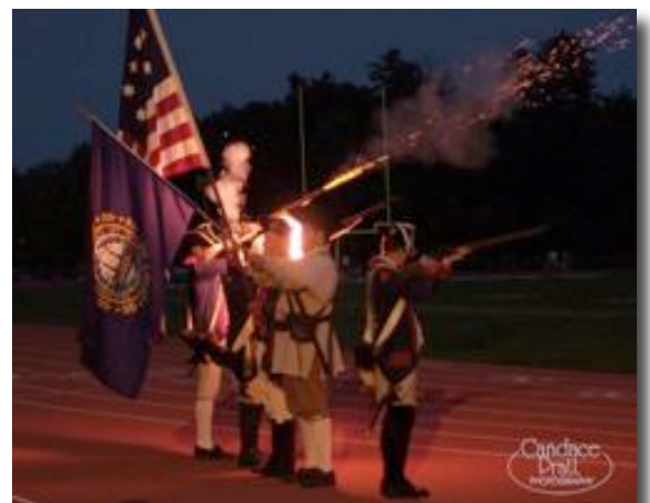
The Newmarket Militia Honor Guard

What a great way to kick off a new Rotary year!